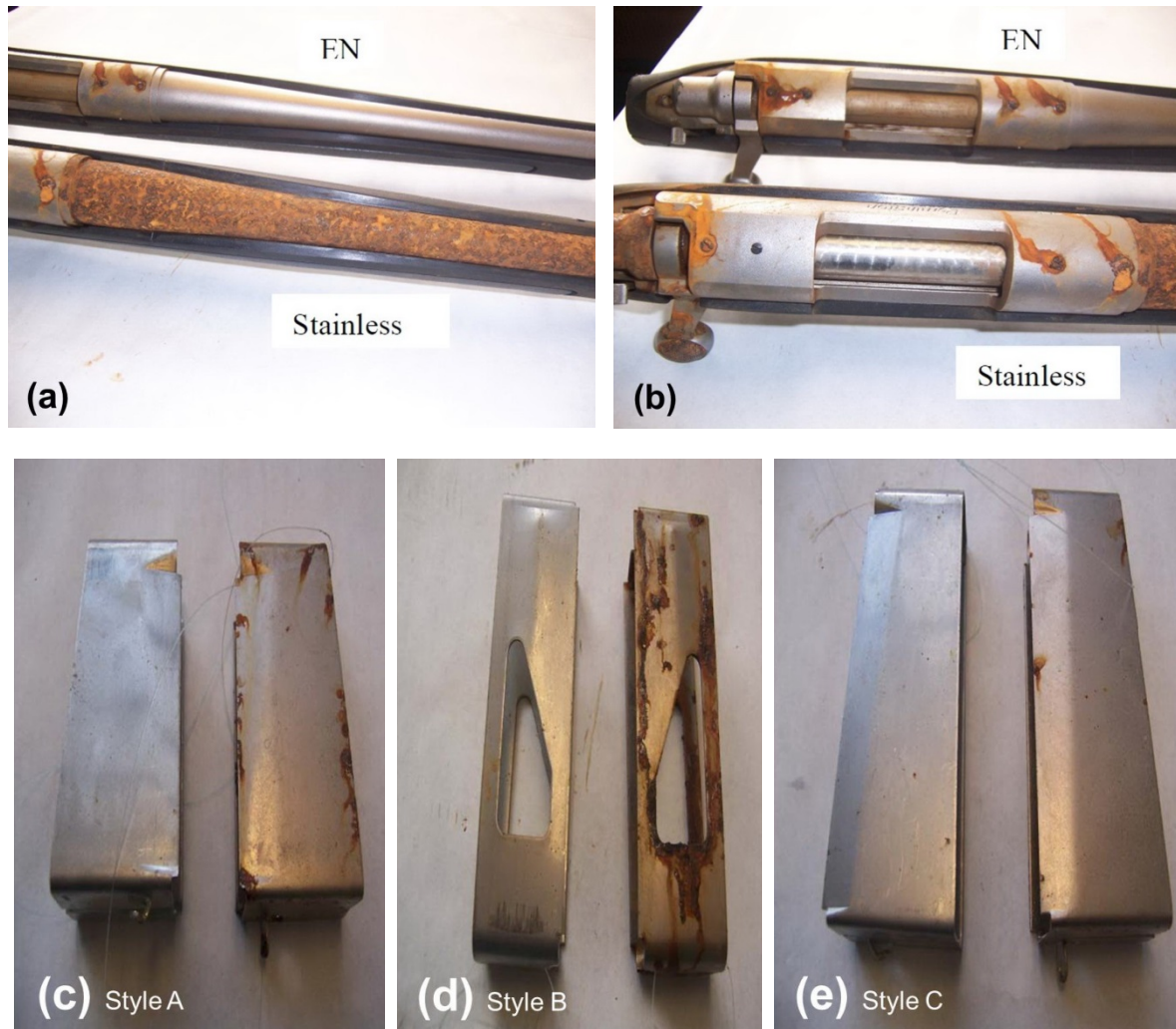
Figure 6 - Corrosion test results after 93 hours of salt spray at the end of the test: (a) barrels, (b) receivers, (c) magazine box style A, (d) magazine box style B and (e) magazine box style C. Both stainless (L) and electroless nickel (R) finishes are shown in each photo.

The electroless nickel-plated 1155 steel gun significantly outperformed the 416R stainless steel gun in corrosion resistance as tested with neutral salt spray. The 416R stainless steel barrel began to show red rust within a few hours of being subjected to salt fog, where, at the end of the test at 93 hours, the EN-plated barrel exhibited no corrosion on the outside of the barrel where it was coated. On the inside of the barrels, where there was no EN coating, the barrels exhibited similar rusting conditions.