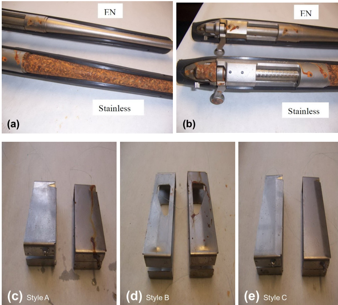
Figure 5 - Corrosion test results after 45 hours of salt spray: (a) barrels, (b) receivers, (c) magazine box style A, (d) magazine box style B and (e) magazine box style C. Both stainless (L) and electroless nickel (R) finishes are shown in each photo.