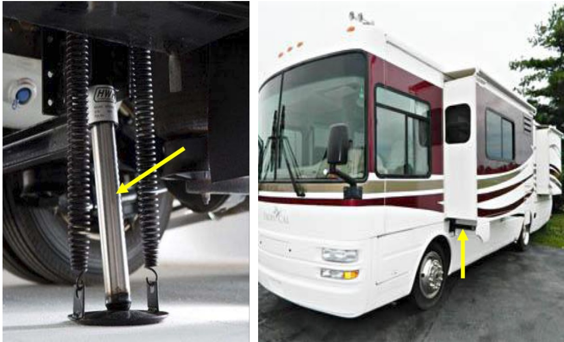
Figure 2 - Products for recreational vehicles and campers: (a) Load leveling jack; (b) RV slide-out system.