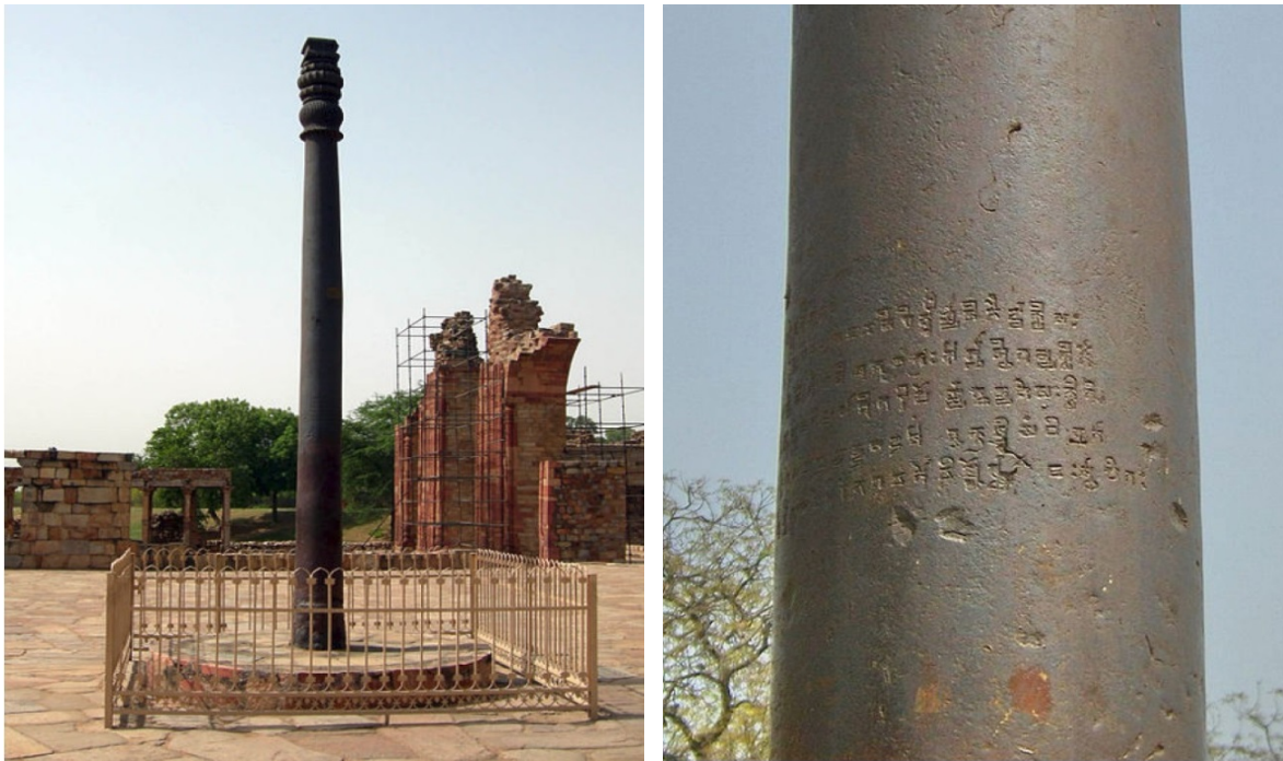
Figure 1 - (a) Iron Pillar of Delhi, 1600 years old; (b) Close-up showing minimal corrosion.

Concerning hardenability, as was previously stated, austenitic stainless steels generally cannot be hardened by heat treatment. Because of these drawbacks, at least two manufacturers have either switched, or considered switching to, electroless nickel (EN)-plated mild steel. What follows are two case studies related to these manufacturers' experience.